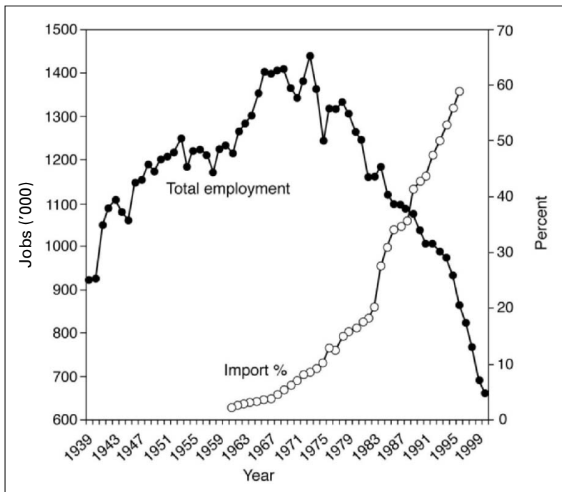
FIGURE 1. Apparel employment ('000s) and import penetration (%), 1939–2000. Sources: US Bureau of Labour Statistics (2001); US Department of Commerce, Office of Textiles and Apparel (2001); US Bureau of the Census (2001).

Since 1980 import competition has cut employment in the US apparel industry by half, over 600 000 jobs. What is left of the garment industry in the USA is produced by low-wage labour, much of it paid below the legal minimum wage; some of the work performed is formally prohibited homework, or is done by illegal immigrants. 8 Two great suppliers have become the lions of the US market.